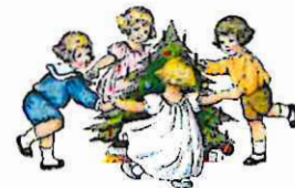
A Joyful Christmas

The theme this year is "Rocking Around the Christmas Tree." Please let us know if you would like to participate!