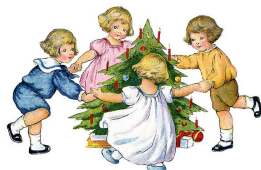
A Joyful Christmas

Are you interested in participating in the preparation for the Center for Active Living Christmas Float? The theme this year is “Rocking Around the Christmas Tree.” Please let us know by August 1st!