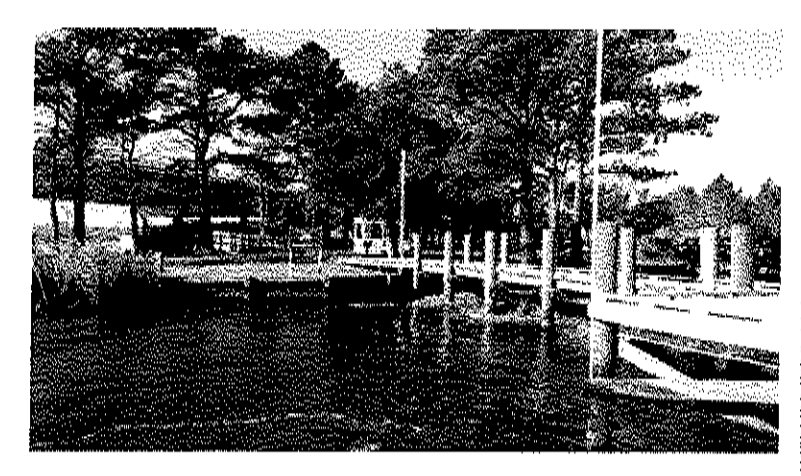
New boardwalks provide access to a new pier, gazebo, picnic tables and grills.