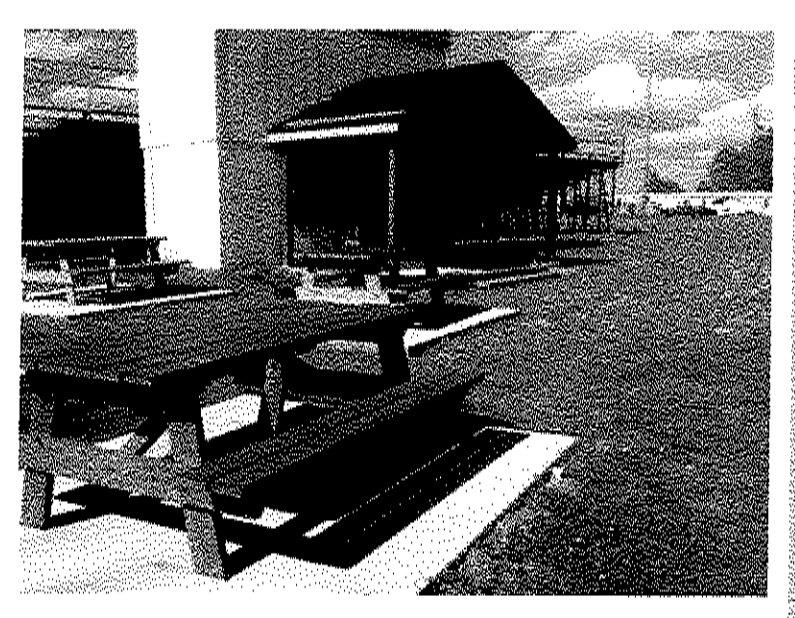
Wetland will be constructed adjacent to an outdoor classroom.

The ARC&D is working with Camden Soil and Water Conservation District and the US Fish and Wildlife Service to develop an outdoor environmental education classroom at Camden High School. A constructed wetland will help filter stormwater from school buildings and recreational fields. The RC&D Council received a $10,000 grant from the US Fish and Wildlife Service for the project. Camden Soil and Water Conservation District received a $10,000 matching grant from NCDEQ Water Resources.