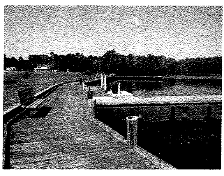
improvements include two 50' piers, bulkhead, kayak launch, benches, and solar lights.

Chowan County has improved public access at Pembroke Creek Park in Edenton with new handicap parking areas, an improved entrance, and two 50' piers from the existing boardwalk to improve fishing. A new bulkhead is protecting shoreline on the eastern side of the park. The county also installed a floating kayak and canoe launch, solar lighting and a storage shed for kayaks and canoes. The ARC&D assisted the county with project design and grant writing. It also provided technical support for the construction phase. The project was funded through a $149,720 grant from the NC Public Beach and Coastal Waterfront Access Program with matching funds from the county.