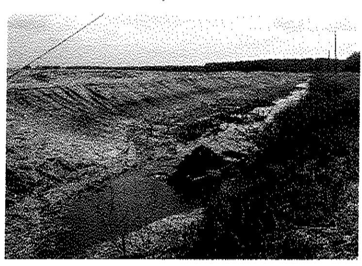
In-stream wetland under construction in the upper Little River watershed. Site is adjacent to the Amazon wind farm.